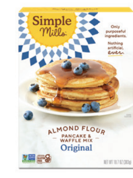
Simple Mills Almond Flour Baking Mix selected varieties